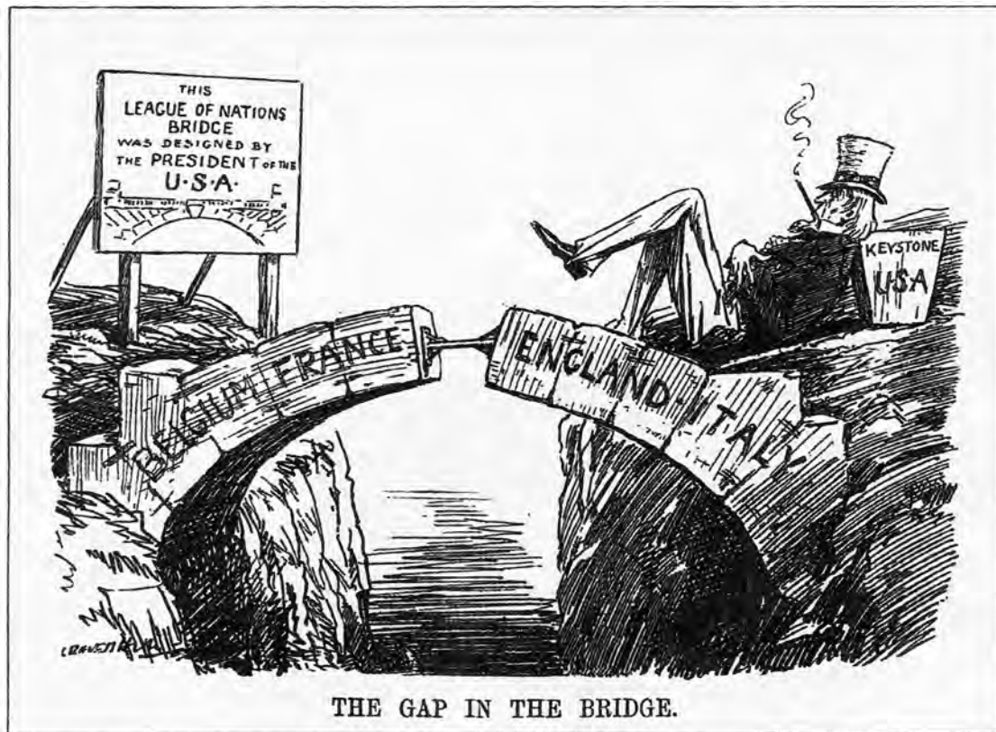
A cartoon published in a British magazine on 10 December 1919.